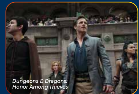
Dungeons & Dragons: Honor Among Thieves