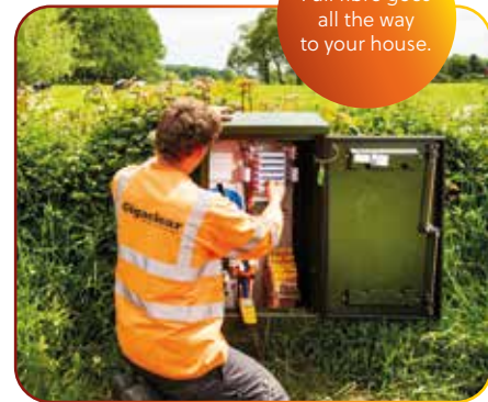
Full fibre goes all the way to your house.

Why part-live life... when you can fully enjoy it!