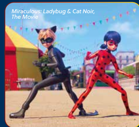
Miraculous: Ladybug & Cat Noir, The Movie