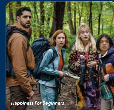
Happiness For Beginners